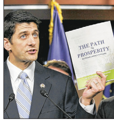
TOUTING THE PLAN: House Budget Committee Chairman Paul Ryan, R-Wis., touts his 2012 federal budget during a news conference on Capitol Hill in Washington, D.C., on Tuesday.

Slashes $5 trillion more during coming decade, restructures Medicare, Medicaid